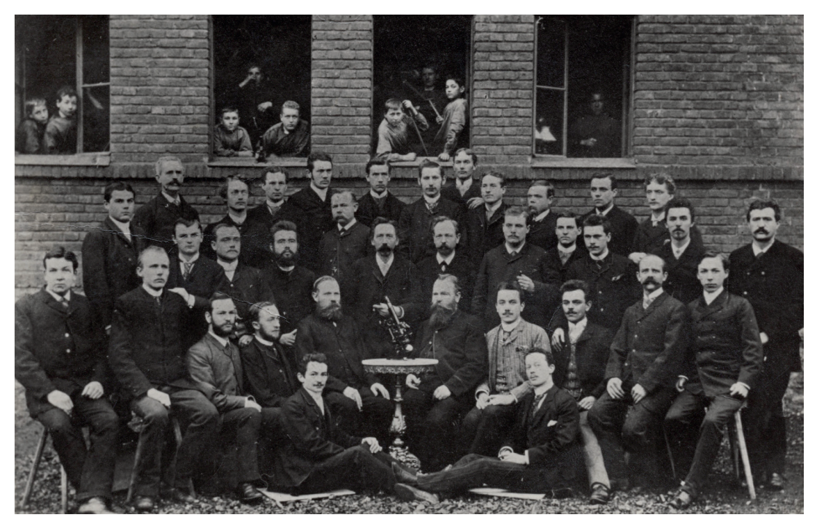
Employees of the Seibert Company around 1892

The property belongs to the Lahn Dill Kreis since 1975. The factory buildings located behind were at last used by the Leitz Company and torn down 1977.